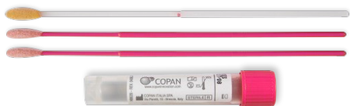
Product # 45545